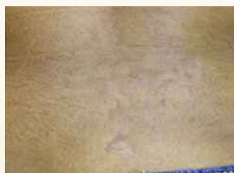
-After 6 Treatments-