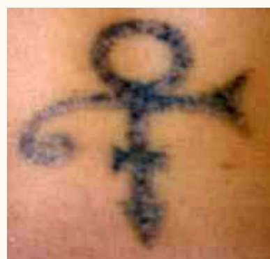
-After 2 Treatments-