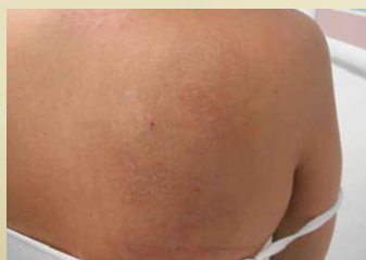
-After 5 Treatments-