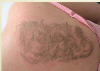
-After 2 Treatments-